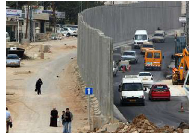
February 20, 2005 - A segment of the separation barrier in a-Ram, north of Jerusalem.