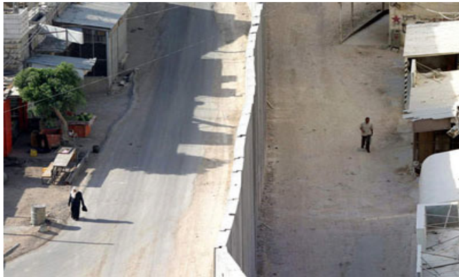
Israeli Apartheid Wall in E. Jerusalem.